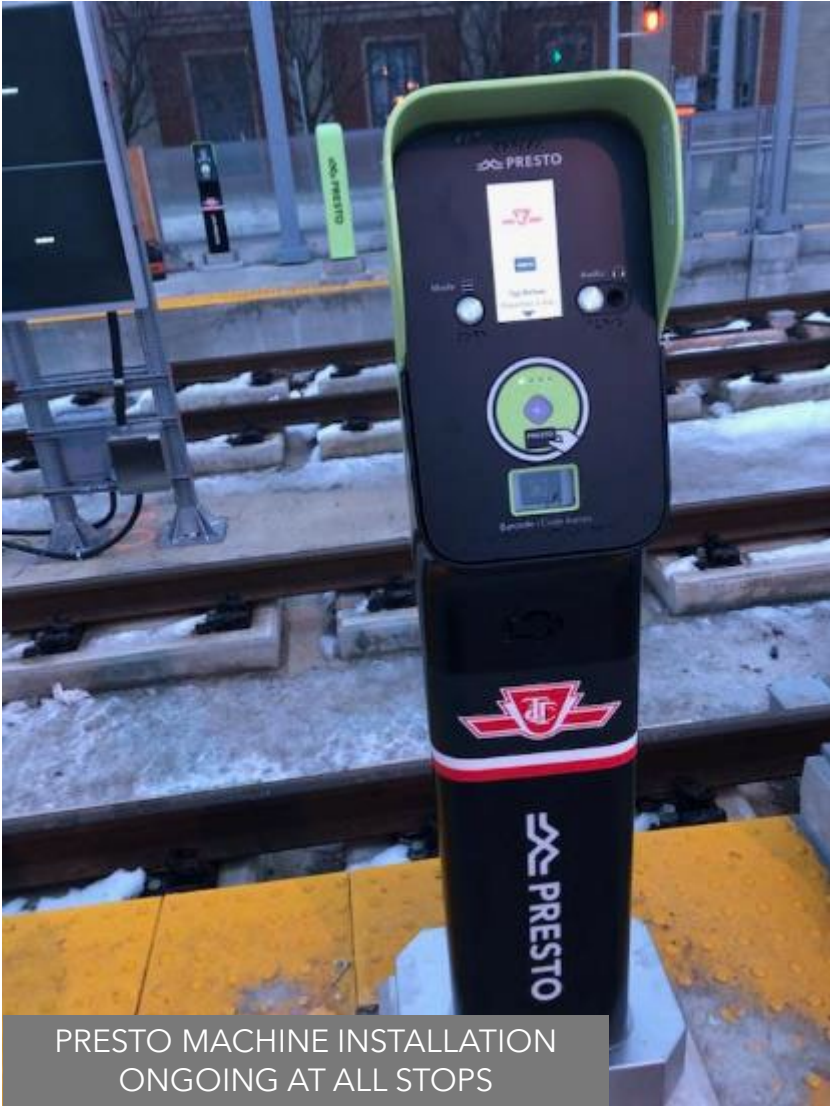
PRESTO MACHINE INSTALLATION ONGOING AT ALL STOPS