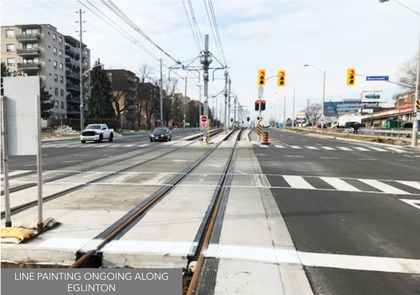
LINE PAINTING ONGOING ALONG EGLINTON