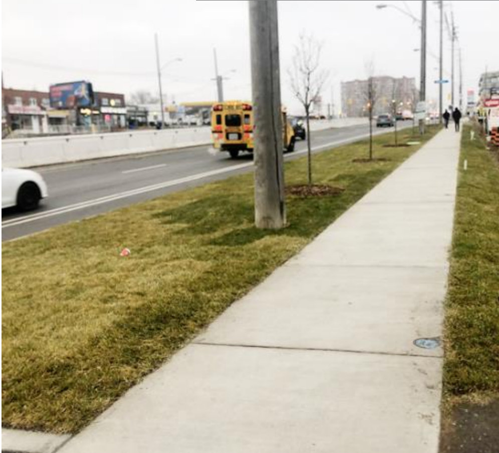
SIDEWALK NEAR KENNEDY PORTAL