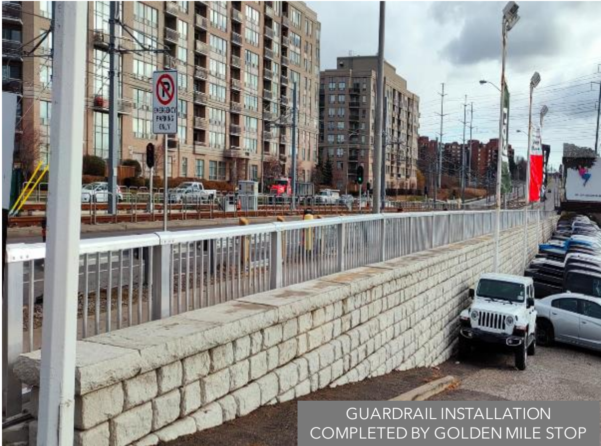
GUARDRAIL INSTALLATION COMPLETED BY GOLDEN MILE STOP