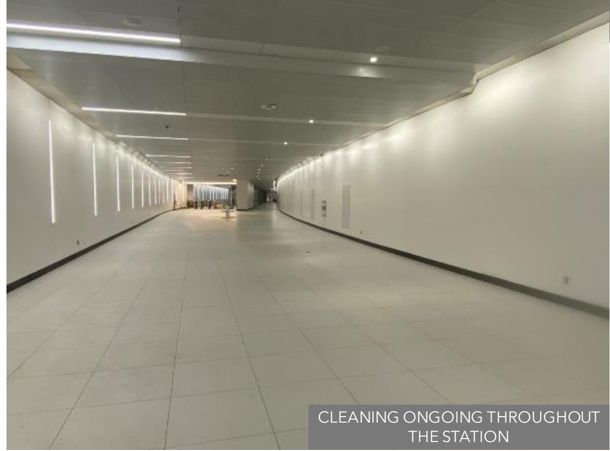
CLEANING ONGOING THROUGHOUT THE STATION