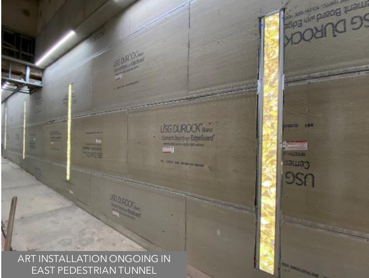
ART INSTALLATION ONGOING IN EAST PEDESTRIAN TUNNEL